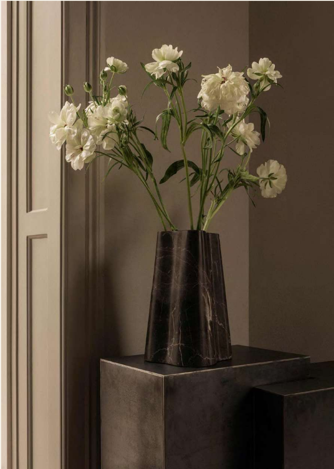
TRUNK GRAND VASE - SHADOW BLACK.