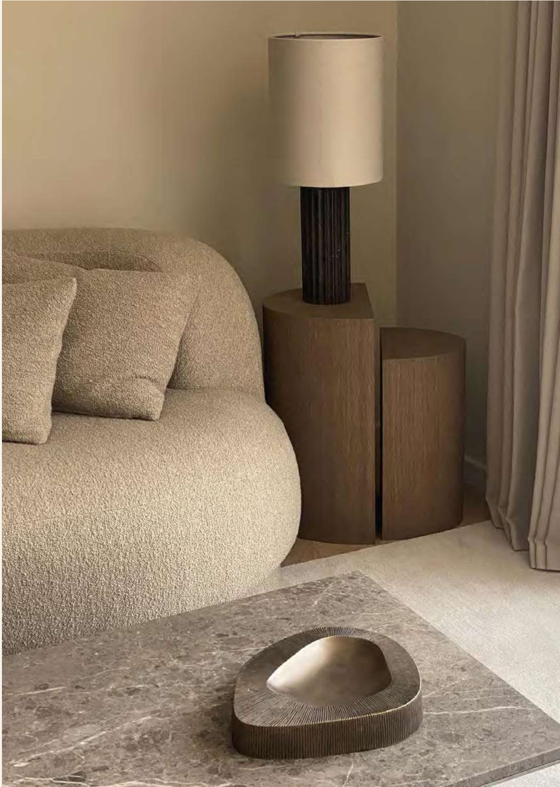
BRANDT COLLECTIVE INTERIOR PROJECT OF OFFICE SPACE 2022. COLONNADE TABLE LAMP - VALLY BOWL LARGE - NEST COFFEE TABLE.