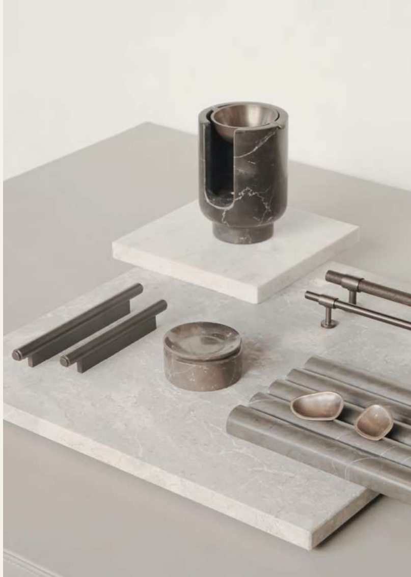
AURA OIL BURNER - EDO CANISTER - COLUMN PULL BARS - CLASSIC PULL BAR - REFINED PULL BAR - ARDEN TRAY - VALE OVAL KNOB - VALE KNOB.