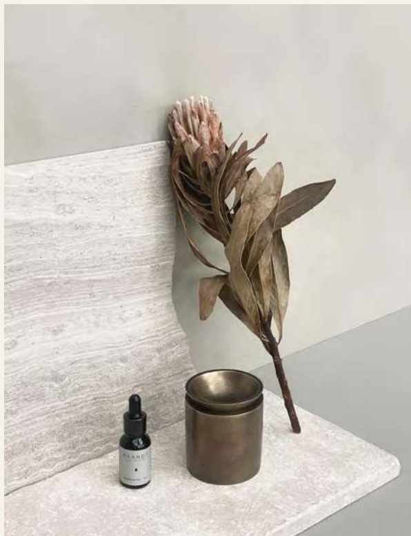
SENSE OIL BURNER - MOMENTO OIL.

Our designs draw on an eclectic mix of influences, eras, and materials rooted in a Scandinavian sensibility with international appeal. Always guided by the perception that details make the difference. Hardware holds the power to transform the aesthetic of your kitchen or wardrobe, as a scent can alter your mood or awaken your memories, profoundly influencing your perception of a space. The intuitive tactility of a well-crafted object will stimulate your senses and enhance the ultimate feeling of an interior. Our collections strive to contribute to a warm and welcoming atmosphere that celebrates the innate beauty of natural materials, textures, and tonalities.