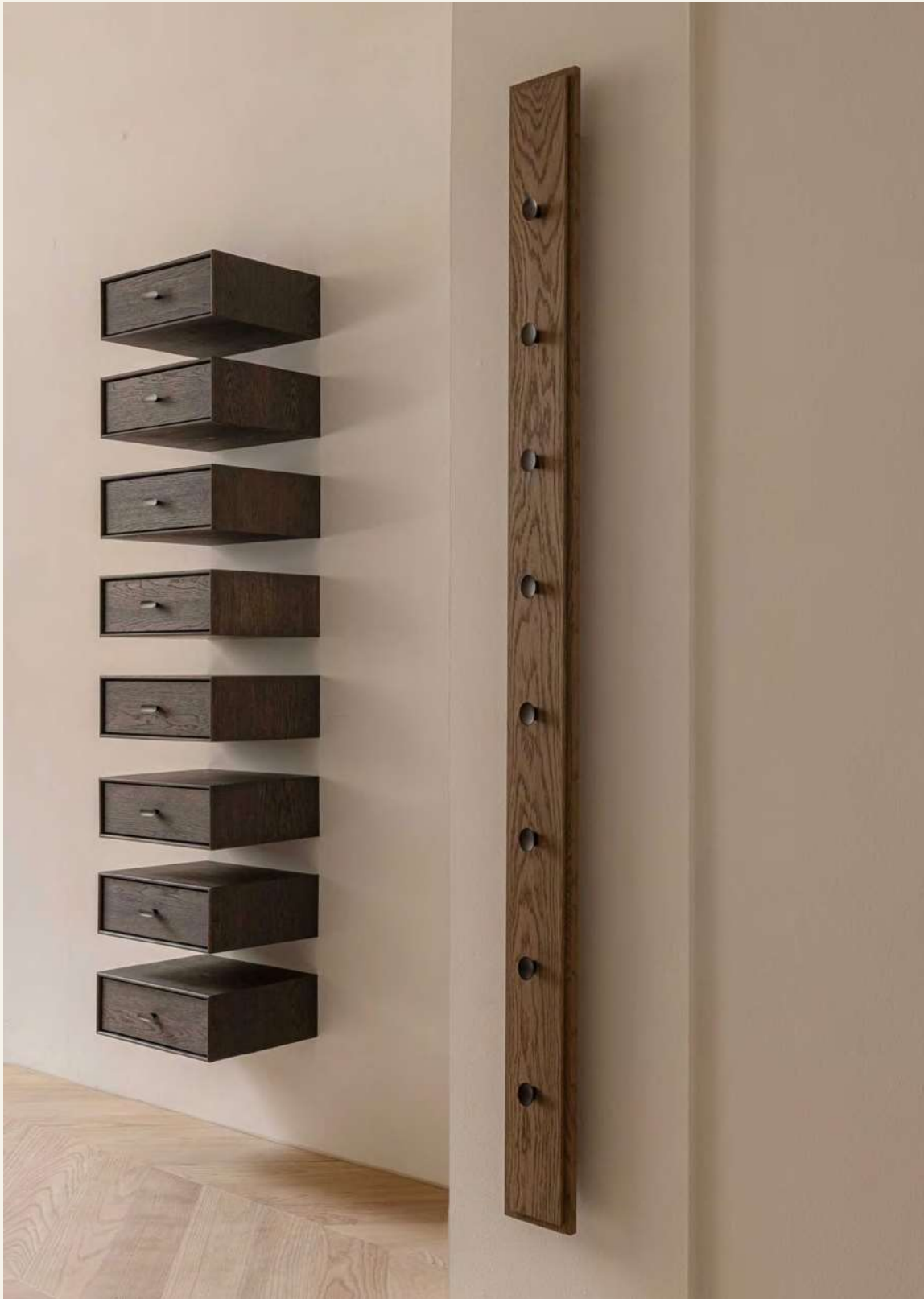
FROM OUR EXHIBITION "REPETITIONS" FOR 3DAYSOFDESIGN. ARTPIECE MADE IN COLLABORATION WITH NORM ARCHITECTS. LEAF T-BARS & KNOBS.