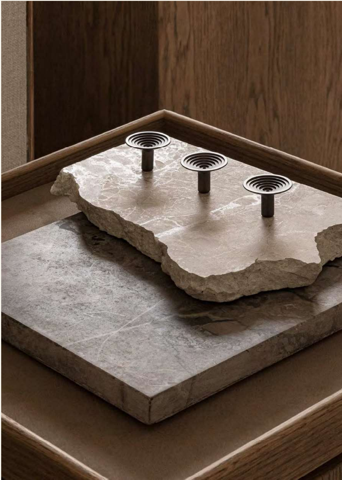
FROM OUR EXHIBITION "REPETITIONS" FOR 3DAYSOFDESIGN. ARTPIECE MADE IN COLLABORATION WITH NORM ARCHITECTS. TERRACE KNOB.