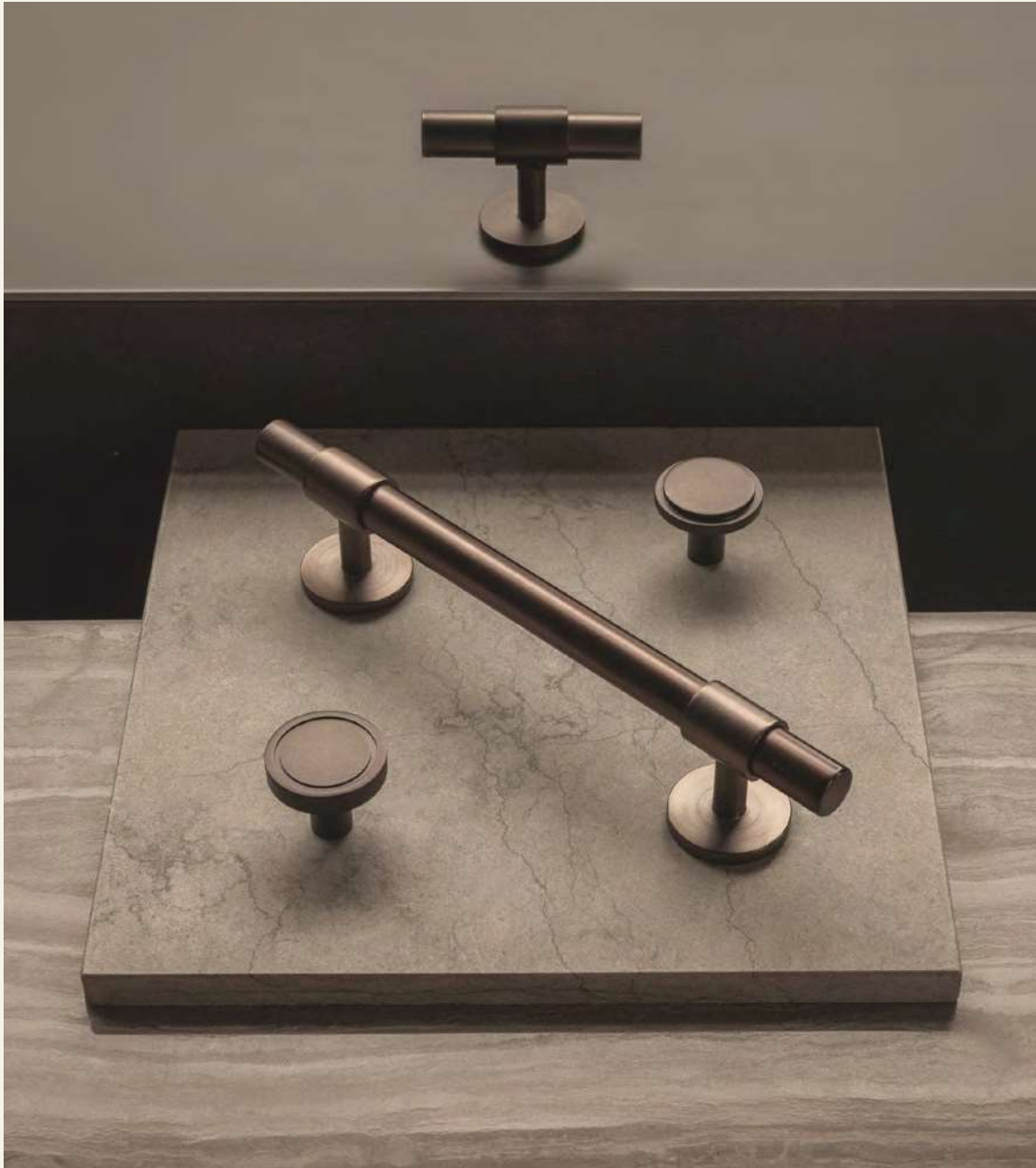
SIGNATURE T-BAR - SIGNATURE PULL BAR - EDGE KNOB - CHISEL KNOB.