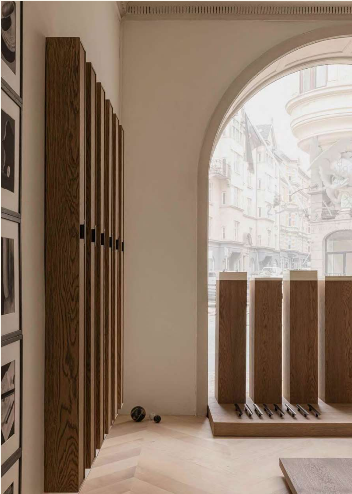
FROM OUR EXHIBITION "REPETITIONS" FOR 3DAYSOFDESIGN. ARTPIECE MADE IN COLLABORATION WITH NORM ARCHITECTS. BUTTON PULL BAR - LEAF PULL BAR.